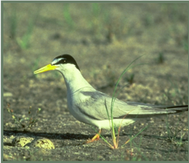
Interior Least Tern